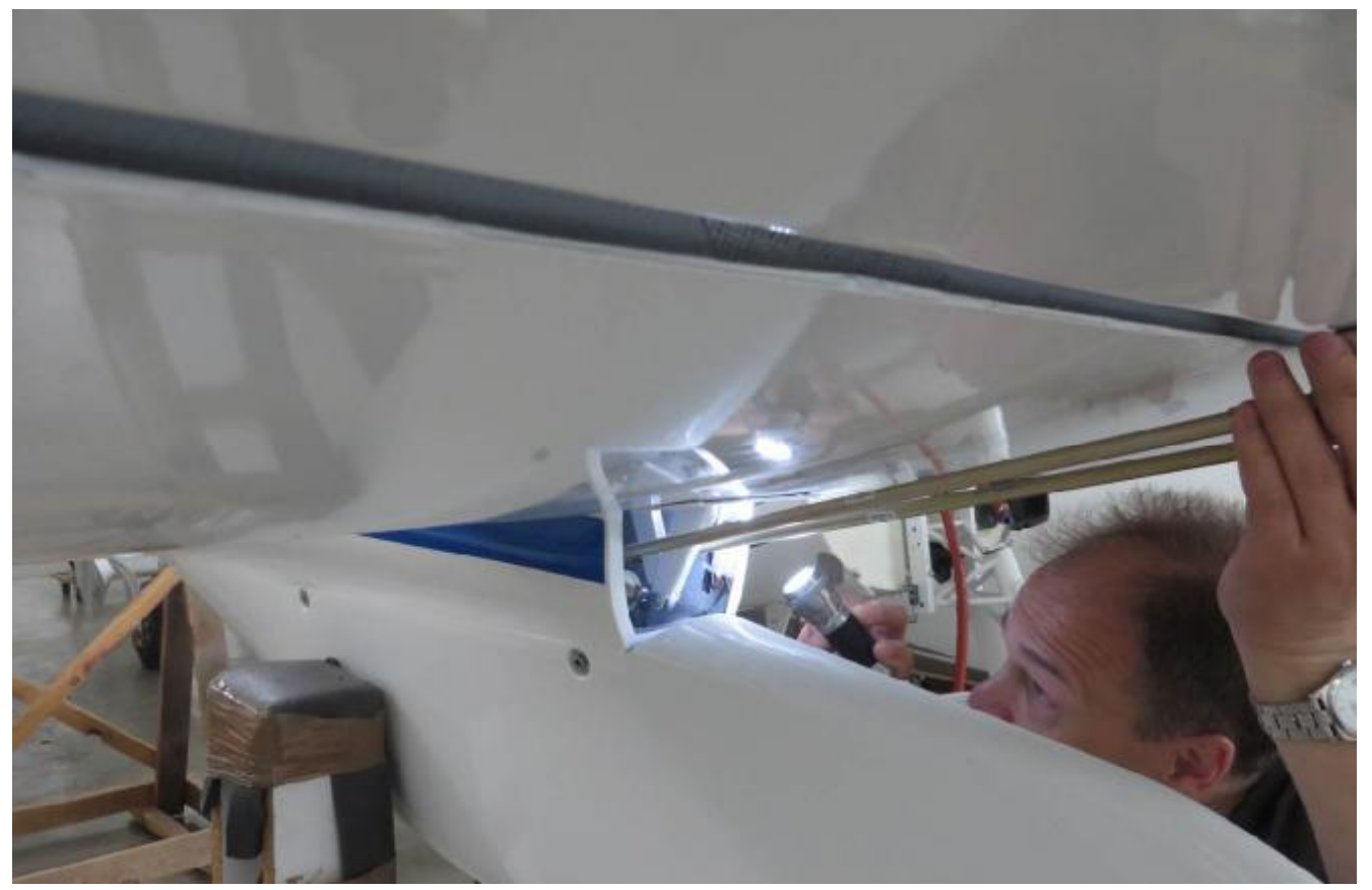
Fig. 4 – Inspection of stabilator mounting pivot.

- Check area of pivot axis support (area 5, according Fig.3), especially in corners of part (from left and right side of part).