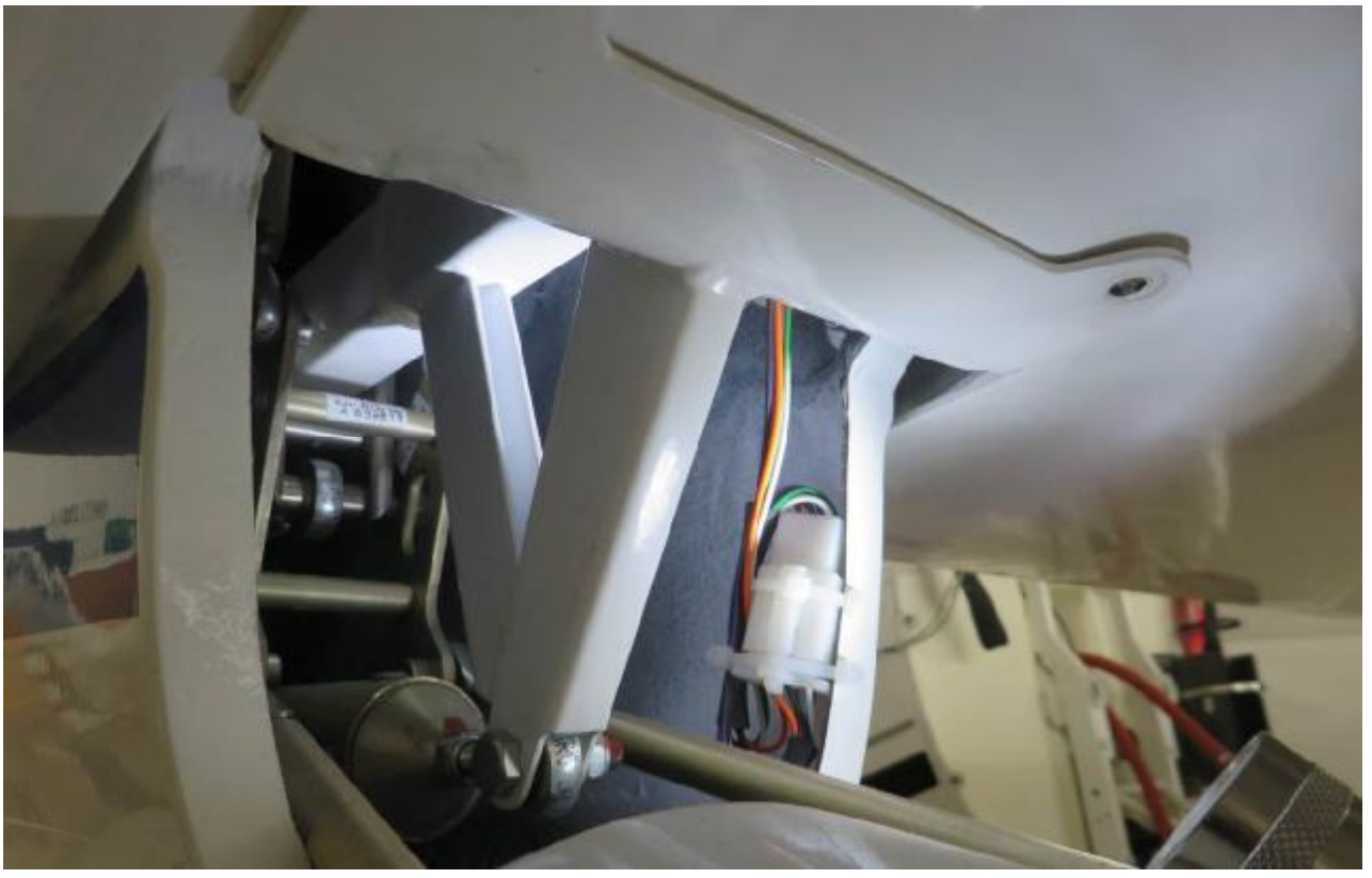
Fig. 2 – General view to area of stabilator mounting pivot to be inspected.

Fig. 1 – Sample view of the location of the stabilator mounting pivot on aircraft.